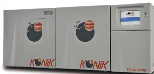
KONIK MSQ12 GC