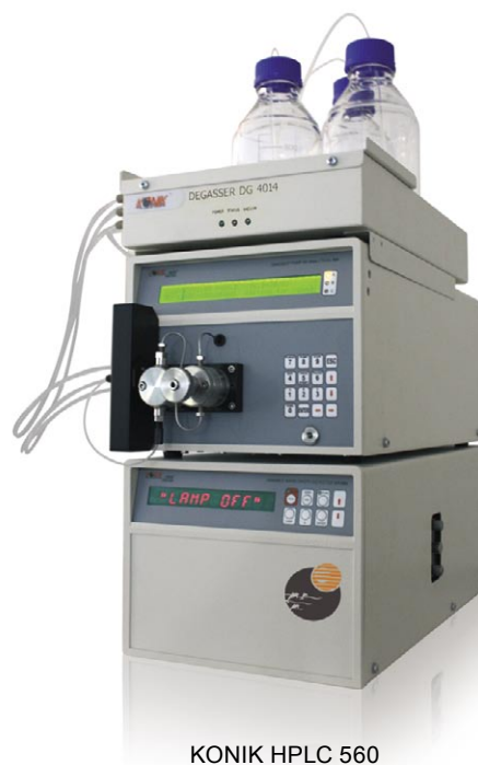
KONIK HPLC 560

NOTE: We also sell spare parts compatible with the major brands of HPLC (Check valves, seals, pistons). Please don't hesitate to ask for a quote.