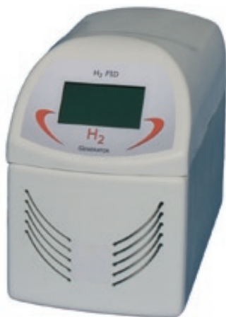
H2 FID GAS GENERATOR

The KONIK series Hydrogen Gas Generators are the economical alternative to high pressure gas cylinders in the laboratories. Purities up to 99.9999 % are available and the generators offer silent operation at pressures up to 10 barg (155 psig).