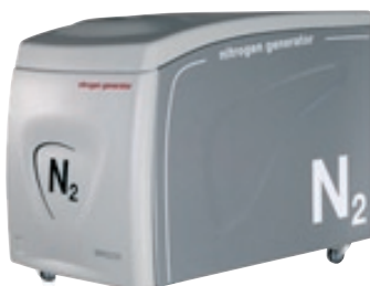
N2 XALOC-GREGAL GAS GENERATORS