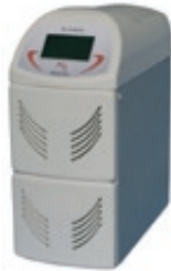
H2 Carrier Gas Generator