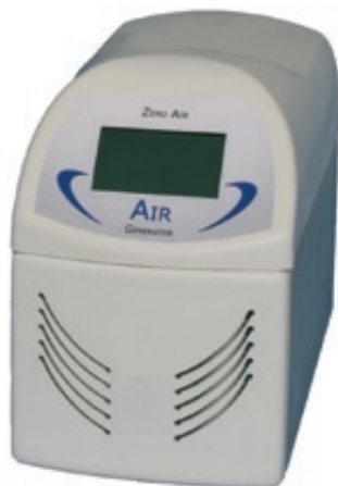
ZERO AIR GENERATOR

The KONIK series has developed a full range of Zero Air Generators which fits almost any laboratory requirement for clean air. The ZERO AIR series is split into two families: the low flow capacity models as table-top units and the high flow capacity models with built-in oil-free air compressors (within floor casing).