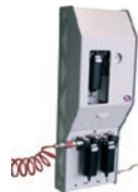
LCMS N2 Generator (membrane)