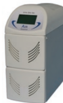
ULTRA ZERO AIR Gas Generator