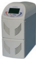
H2 FID AIR Gas Generator