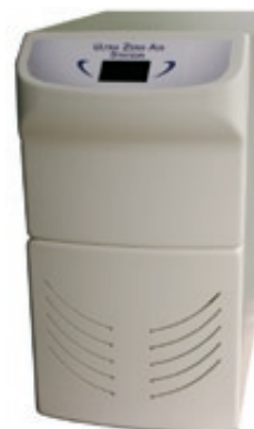
ULTRA ZERO AIR STATION Gas Generator